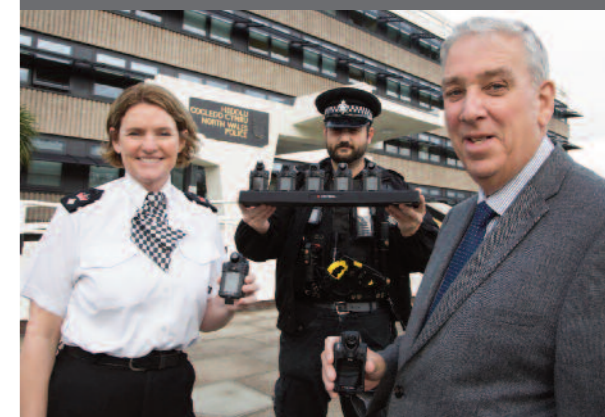
Body worn video investment

This leaflet gives a breakdown of how much of your council tax is spent on policing and an indication of where your money goes. For more information about the police budget, please visit my website: www.northwales-pcc.gov.uk