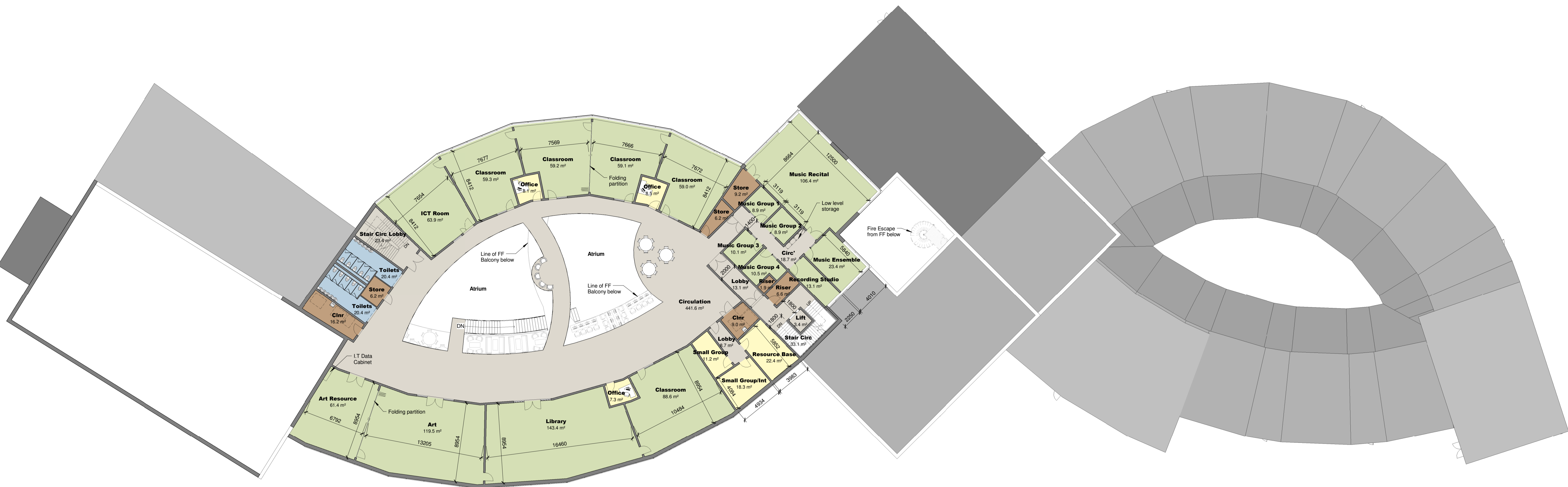
G.A. Second Floor Plan as Proposed Scale: 1 : 215