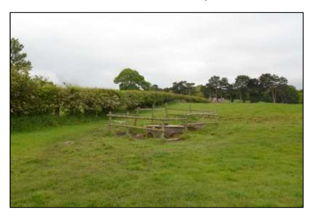
Looking down to the pond from the well

The well which is the water source for the pond