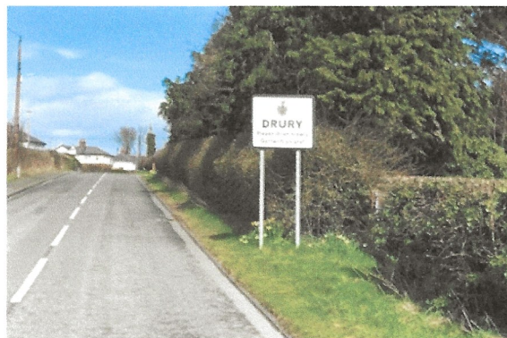
fig. 1 Drury sign on Drury New road

5.4 On the approach to the village of Drury along Drury New road the village placename sign can be seen. It could be reasonably considered by members of the public that the location of the Drury sign indicates where the village (settlement) boundary is. It is where the built form for the village commences. The sign is located just south of the southern boundary of Newlands ( fig. 1 below ). Both Newlands and Benbradagh are considered part of the community rather than being in the open countryside, although the existing position of the settlement boundary dictates otherwise.