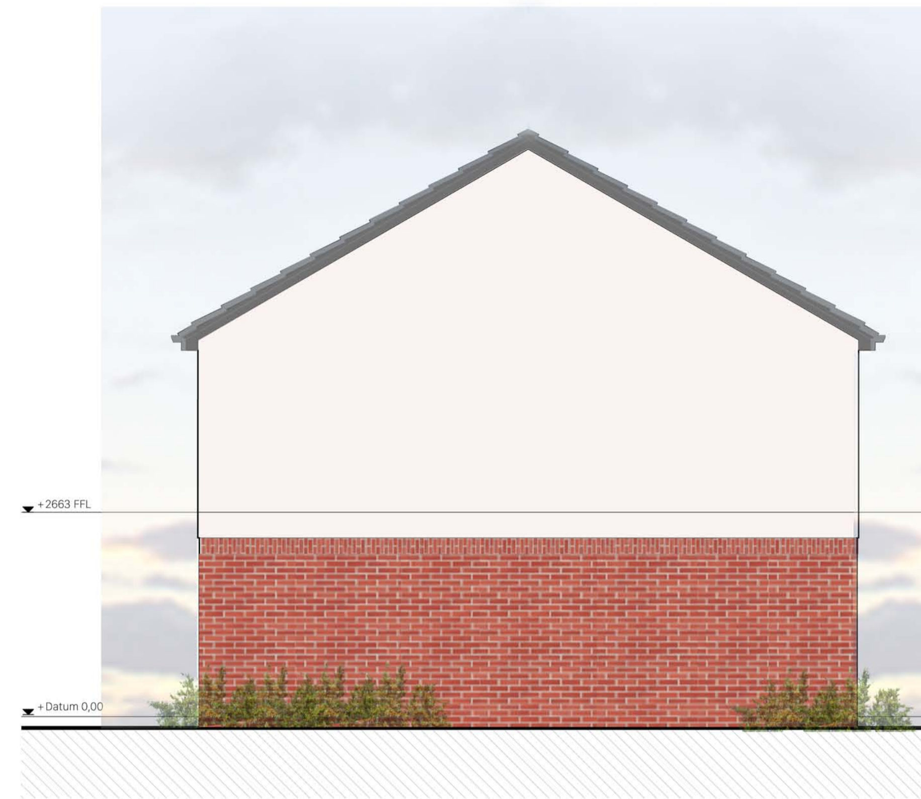
PROPOSED SIDE ELEVATION 1:50 @ A1