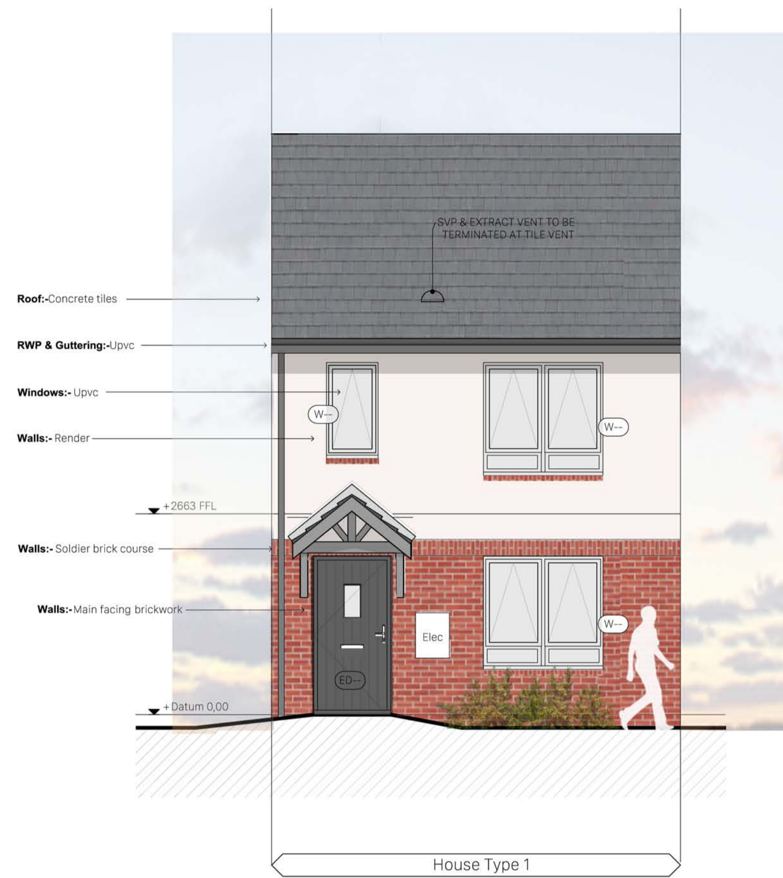
PROPOSED FRONT ELEVATION 1:50 @ A1

Drawing based on survey information provided by third party measured surveys. Any discrepancies to be reported to the architect.