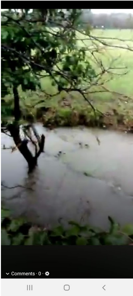
Photo's not great as it's dark but house under water in middle of mancot