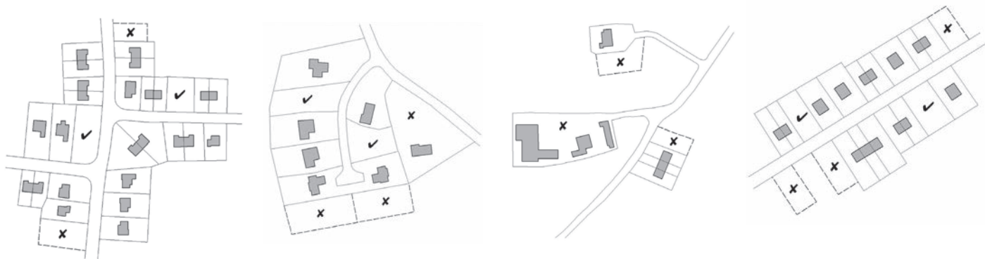
Fig 2 Infill development - Examples of acceptable and unacceptable locations

Note: The acceptable locations would still have to be acceptable in relation to other normal planning considerations.